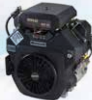
KOHLER 23 HP Command Pro CH680