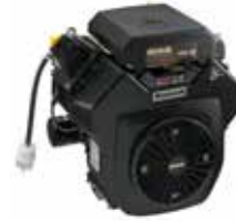
KOHLER 20 HP Command Pro CH640