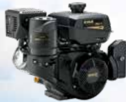
KOHLER 14 HP Command Pro CH440