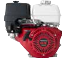
HONDA 13 HP GX390