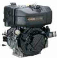
KOHLER 9.1 HP Kohler Diesel KD-440

NOTE: Only pressure lubricated units are capable of 250 PSIG operation. Units tested in accordance with CAGI/PNEUROP Acceptance Test Code PN2CPTC3. Dimensions are for R-Series compressors. Add 1" to the width for PL units.