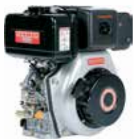
YANMAR 9.1 HP L100V